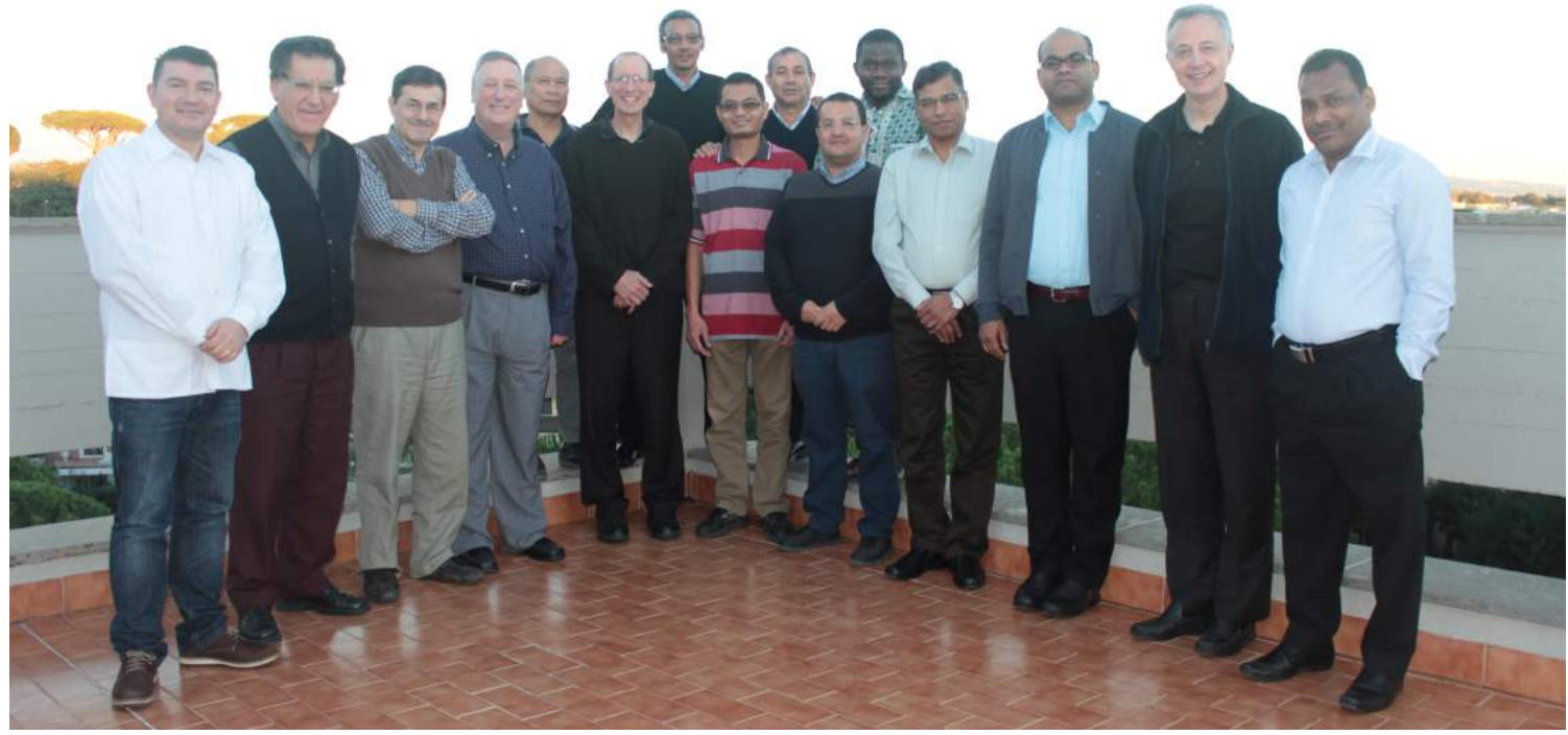
LOCAL COMMUNITY OF THE GENERAL CURIA