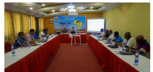
COVIAM: Conference of Visitors of Africa and Madagascar Page 05