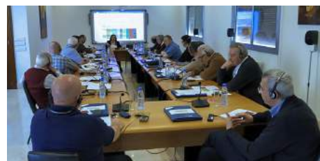
Annual Assembly of CEVIM in Beirut (Lebanon) Page 04