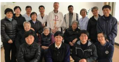
Superior's General Canonical Visitation of the Chinese Province Page 02