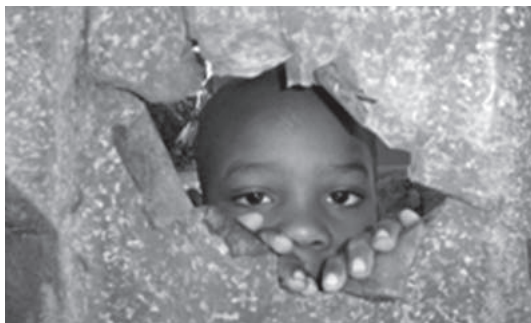
A 'restavek' child seeking relief

"You have made us for yourself, O Lord, and our hearts are restless until they rest in you" (St. Augustine of Hippo).