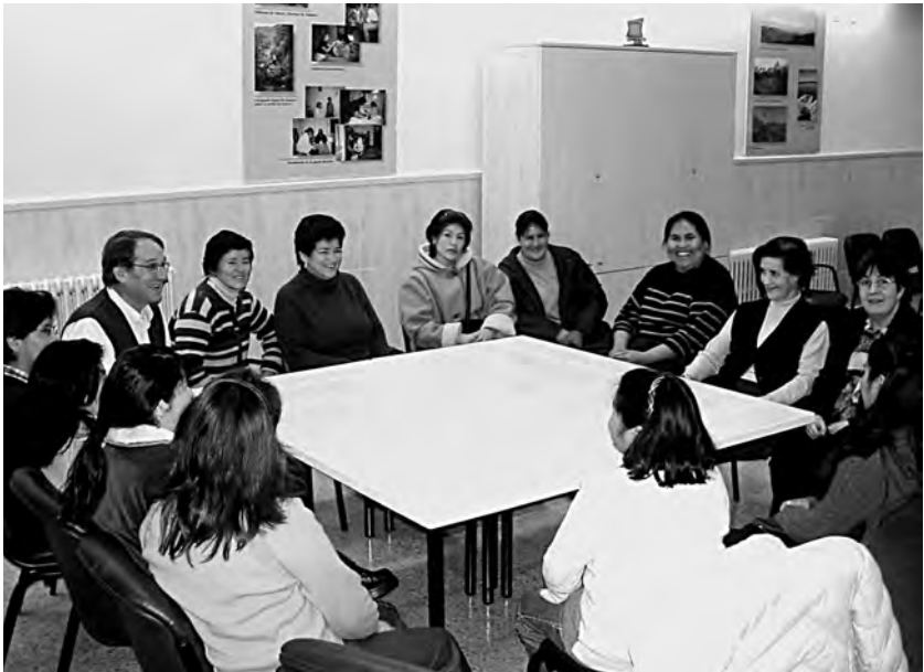
A meeting of the pastoral service of "Open Hands" with the immigrants (Navarra, Spain).