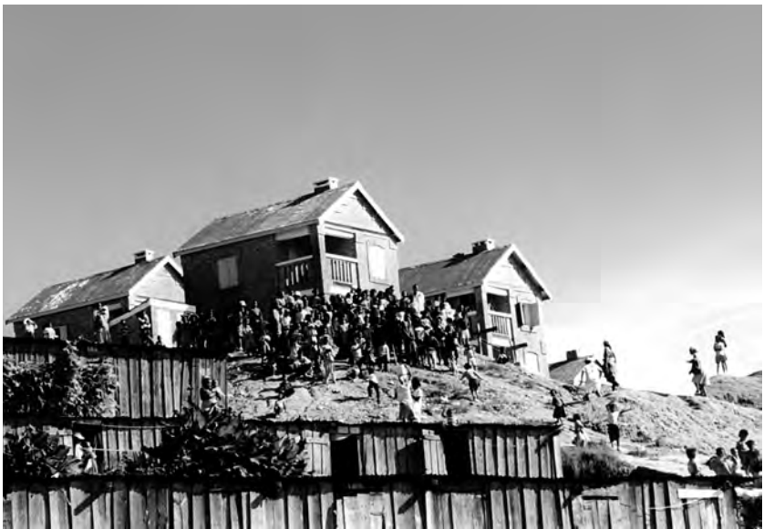
The wooden houses are disappearing little by little, but this depends, you can be sure, on people's generosity.