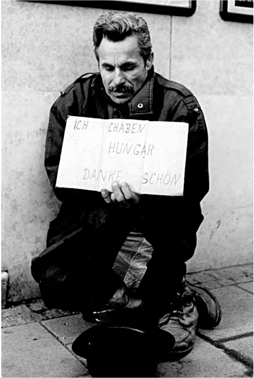
A Roma begger in Graz (Austria): "I am hungry. Thank you."