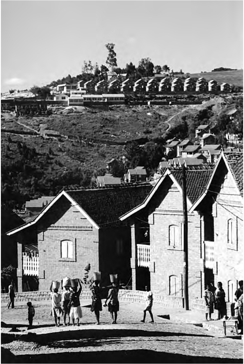
Above, Bemasoandro (Madagascar), with a primary school.