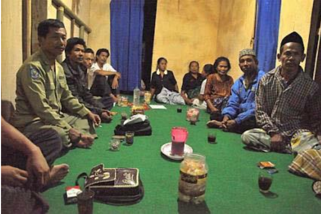
Farm workers meeting for training and organizing

Farm workers in many areas of Indonesia suffer low wages, poor living conditions, lack of schooling for their children, and limited rights to gather and speak. Our Indonesian confreres have been working to train and organize workers in the East Java Province for some time, targeting large, unjust plantations. The confreres teach the struggling workers their rights according to Indonesian law, and develop leaders and cohesive groups to advocate for better working conditions and fair compensation.