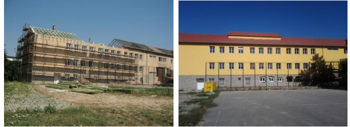
St. László during and after renovations

The Province acquired the school building from the Hungarian government. The building has needed improvements for some time. It has also been too small to accommodate the growing enrollment.