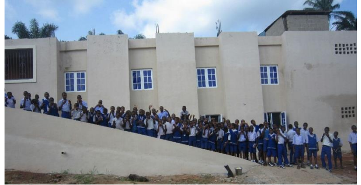
The new inclusive school hostel and its students

Many of the children at St. Joseph's and De Paul live far away and need to board at the schools. Our confreres in Oraifite decided to further integrate the children that have disabilities with those who don't at the schools, by having them live together. They needed to construct a new hostel in order to do this.