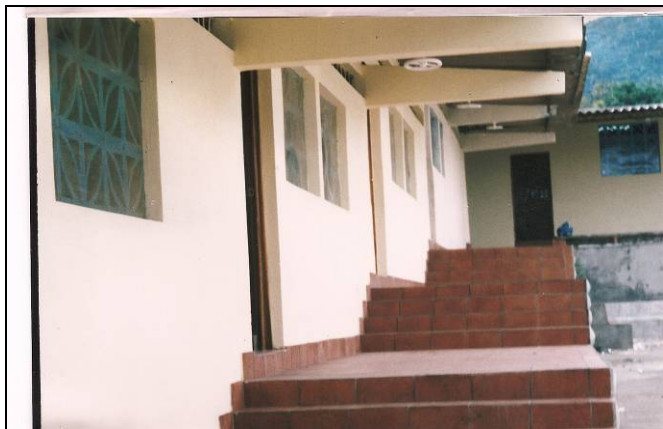
The restored Father Antonio Comte Retreat House

The modern history of El Salvador is marked with violence and economic instability. Challenging socio-political conditions continue in the country. The civil war that ended in 1992 in El Salvador forced our confreres to abandon their mission house in the City of Alegría. The house had been established in 1906 and fell into ruin during the years it remained empty. A few years ago confreres of the Province of Central America began to renovate the house in Alegría to convert it into a retreat and formation center for evangelization, social action, and training in agriculture and literacy. The Province of Central America applied to the VSO for a VSF Micro-Project grant to finance further improvements at the house. The VSO awarded a micro-project grant which enabled the Province to fully restore the house, now called the Father Antonio Comte Retreat House.