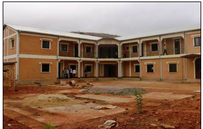
The new apostolic school in Fianarantsoa

For many years the Province of Madagascar lacked a residence for seminarians completing the second stage of their religious formation: the three-year apostolic school. This situation impeded candidates from rural places in Madagascar from successfully participating in the formation program of the Province. Candidates from these places have inadequate access to effective secondary schooling. As a consequence, they often lack the academic skills needed to complete the rigorous requirements of the major seminary. For this reason the Province of Madagascar obtained a temporary residence in 2004 to enable seminarians to take pre-university courses at a Catholic preparatory school in Fianarantsoa. The students conduct studies in liberal arts and sciences at the school to prepare for their coursework in philosophy and theology.