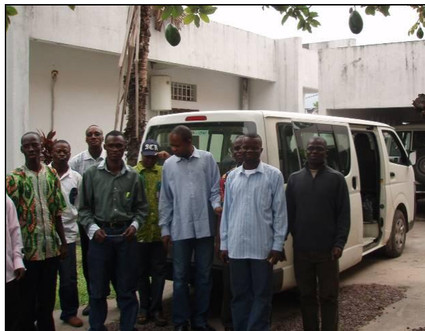
Seminarians with their new minibus in Kimwenza

and houses the province's philosophy and theology students. The students travel substantial distances to institutes where they take their classes.