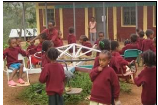
Children play on the merry-go-round in Shera Qeja