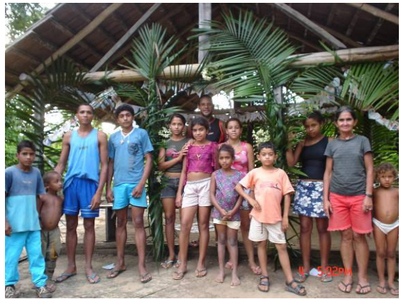
Catechists in an Itaituba Mission village

Some villages are located far from the highways on poor roads that experience frequent washouts. Father Arno developed a training program to form catechetical leaders for the villages. The program was coupled with a feeding program to address malnutrition among village children. The province sought the help of the VSO to secure funding for teaching materials, bibles, and food and transportation costs for the leadership training, and livestock for the feeding program. The VSO obtained private donations, including contributions from confreres in the Eastern Province of the United States, that were matched with monies from the VSF to fund the training and feeding programs.