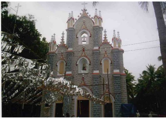
St. Joseph's Church in Koithoorkonam

Recently the Archdiocese of Trivandrum entrusted St. Joseph's Church, a parish in Koithoorkonam in the State of Kerala in India, to the confreres of the Southern Indian Province. The parish is constituted by 260 families and 5 substations. Many parishioners suffer poverty and unemployment.