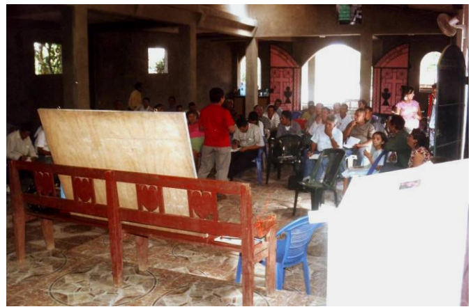
Workshop at the Parroquia San Antonio de Padua

Recently confreres of the Province of Central America began working at a new parish in El Salvador: the Parroquia San Antonio de Padua in Nueva Concepción, Chalatenango. The parish comprises 29 dispersed communities. Many of the communities lacked pastoral services for years. Most suffer extensive poverty and social problems. The confreres serving the parish saw an urgency to form pastoral agents to serve these communities. Through their Province they obtained a VSF Micro-Project Grant from the VSO to purchase computer equipment, clerical support, teaching documents, and chairs for workshops to form 75 pastoral agents at the parish.