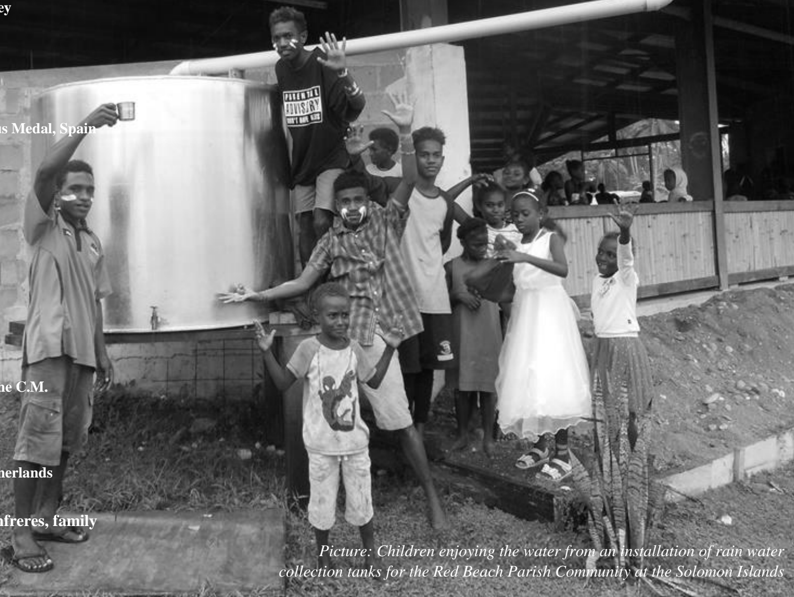
Picture: Children enjoying the water from an installation of rain water collection tanks for the Red Beach Parish Community at the Solomon Islands