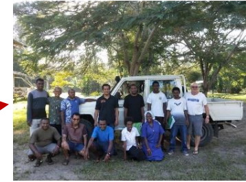
Vehicle for Holy Name of Mary Seminary