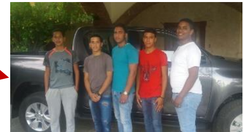
Puerto Rico: truck for use of the Seminary