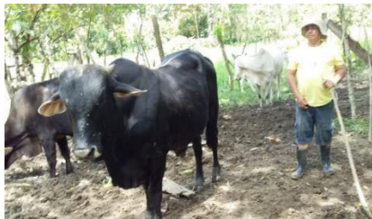
Costa Rica: cattle breeding revenue project

Puerto Rico: Scholarships for students with economic needs at the Colegio MM, Ponce ( see picture )