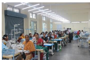
Sewing machines for the De Paul Apparel