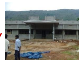
Church at the Jubaguda Mission