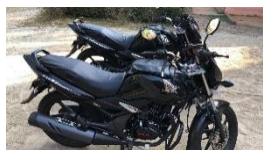
Motorbikes for the Kidarakuzhy Center