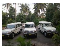
Vehicles for the Jubaguda, Dukuma and Kottogodo Missions