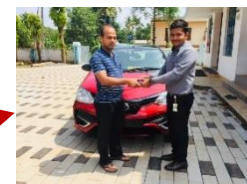
Vehicle for the Vincentian Theologate at Sada Poona