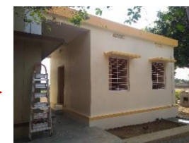
Kitchen for the boys' hostel at the Kanchili Mission