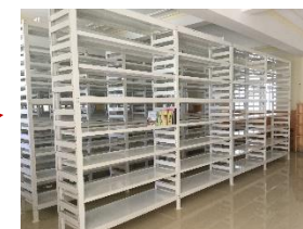
Library of the Durando Institute