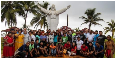
Panama: 2019 World Indigenous Youth Gathering