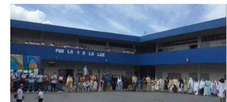
Puerto Rico: Scholarships for students