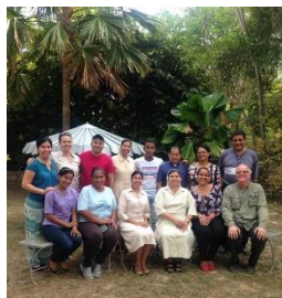
Panama: World Vincentian Youth Day