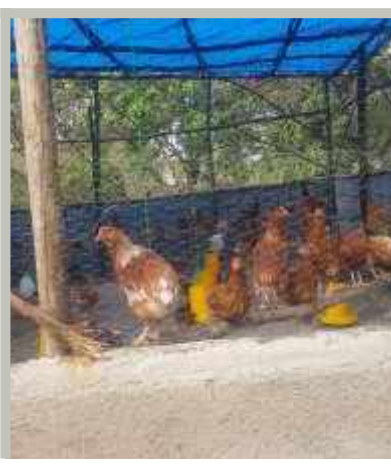
Egg laying hens in new chicken coop at the Parish of Alem Tena

generating income, this project will help improve food security for both the local poor and the local confreres.