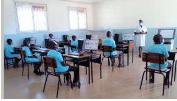
Computer room already set up with students and the computer teacher, explaining how to take care of computers.

The Vincentian Community was looking for ways to improve the opportunities for the young people in the area. With the help of the VSO, they were able to add a computer lab to the school. They purchased six computers, a tablet and a printer. A carpenter helped with tables and chairs. They employed an instructor and added computer studies to the curriculum. With their new computer skills, the graduates will have better prospects for employment. While still in the early stages, it is off to a good start and has enriched the curriculum for the 60 participating students.