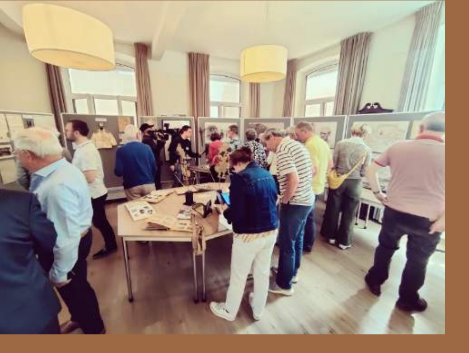
On Mission "for God and Homeland"

The exhibition in the Montgomery room about those who went to "India" unexpectedly drew many visitors, mostly present and former inhabitants of Helden. Many recognized in the pictures and the stories themselves family members or acquaintances who had gone to "India" as soldiers or as Lazarist missioners. In this exhibition indeed, these young men acquired an identity through pictures, documents, fragments of views and of sounds, which had been organized by the broadcasting network P&M. The Helden customs and heritage study club was present, too. Their stall featured a special issue of their club magazine for sale, De Moennik, which was filled with stories by and about soldiers and Lazarist chaplains who had been sent to "India" for "God and Homeland."