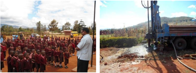
De Paul students and their new well in Mbinga

Two of projects involved the construction and equipping of bore wells. One well serves 400 Matengo tribal children attending De Paul School in Mbinga, operated by our confreres. The VSO obtained monies from Manos Unidas and a U.S.A. donor, and used matching funds from the Vincentian Solidarity Fund (VSF) to finance this well.