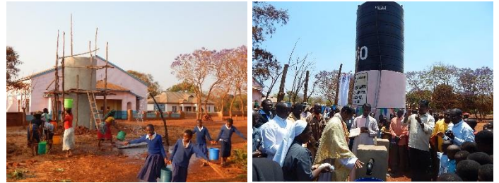
Water stations at the parish and a village in Mpepai

This required the purchasing and laying of piping to reach a water source from a mountain 11 kilometers away, and construction of several water storage tanks.