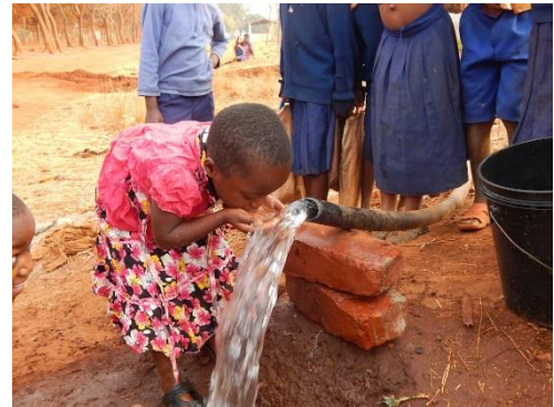
Drinking from one of the Mpepai water stations

The VSO financed this work with monies from another donor in the U.S.A. and from the VSF.