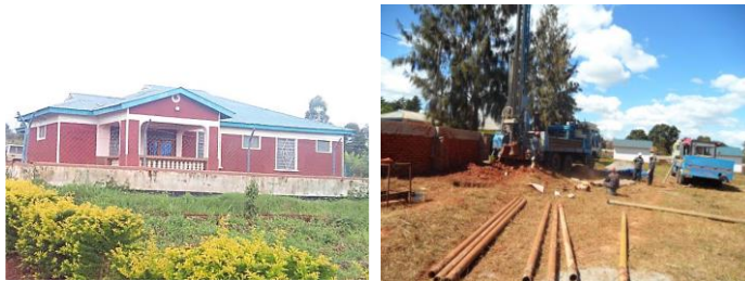
The spirituality center in Mbambi and its new well

The second well provides water for the Vincentian Spirituality Center located four kilometers away from Mbinga in Mbambi. The center hosts overnight retreats, days of recollection, and spiritual conferences for confreres and the clergy and religious in the dioceses where they work. The VSO financed this well with a grant from the Diocese of Essen, and also monies from a U.S.A. donor and the VSF.