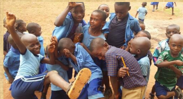
Children served by De Paul Hope Social Center in Nigeria