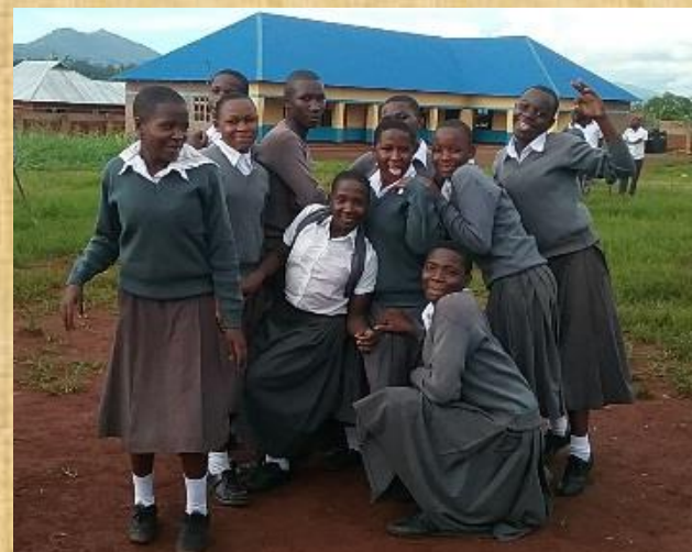
Students from De Paul Secondary School in Tanzania

A 501 (c) (3) organization in the U.S.A.