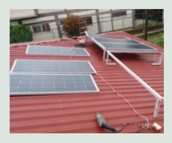
Honduras : Solar panels for the library and office at Puerto Lempira.