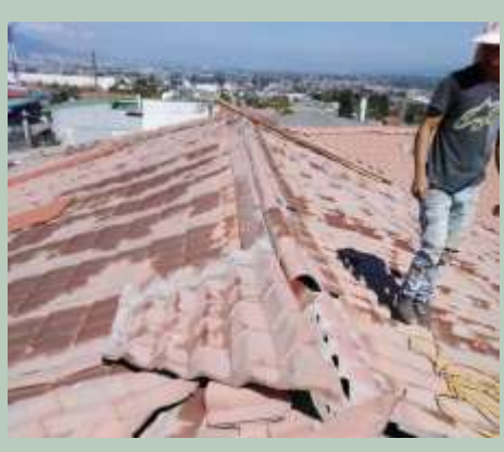
Costa Rica: A new roof for the formation house at Seminario San Vicente de Paúl.