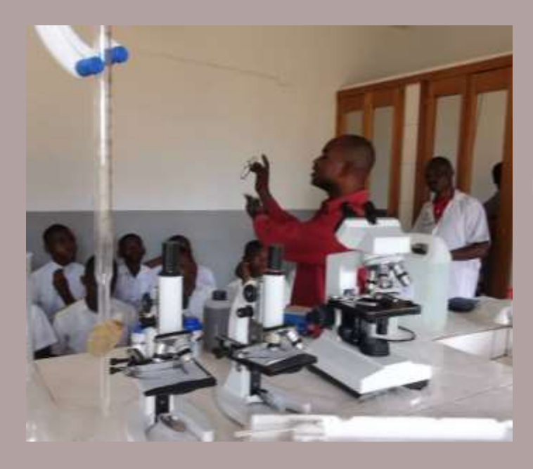
Congo: Equipment for a Science Lab at St. Vincent School, Kinshasha.