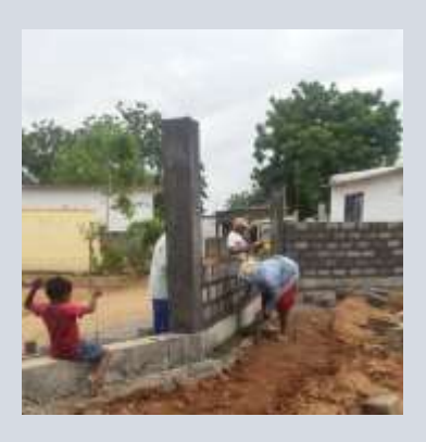
India: Compound wall for the parish church at Kothapetta.