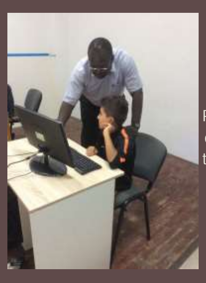
Tunisia: Purchase of computers, training and religious formation