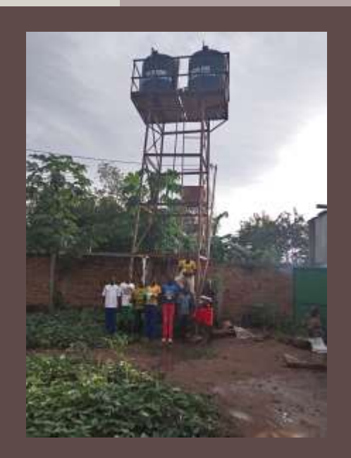
Chad: Construction of a bore hole and overhead tank for Academie St. Jean Paul II, Petit Seminaire, Moundou.