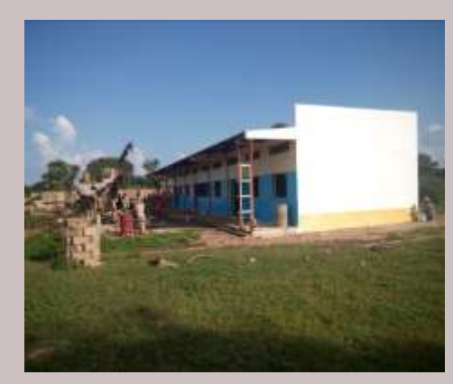
Chad: Construction of a 'threeclassroom' block for Lycée Collège St. Jean-Baptiste de Bebalem.