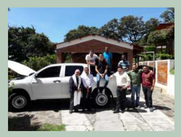
Guatemala: Vehicle for the Inter-Provincial Internal Seminary of St. John Gabriel Perboyre, C.M.

Purchase of equipment and food for workshops fo formation of parish leaders in several countries of Central America.