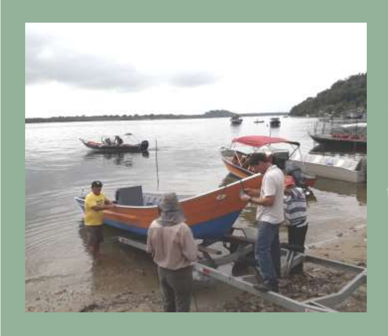
Brazil: Purchase of a new boat as the main means of transport for the parish priest at Guaraquecaba.