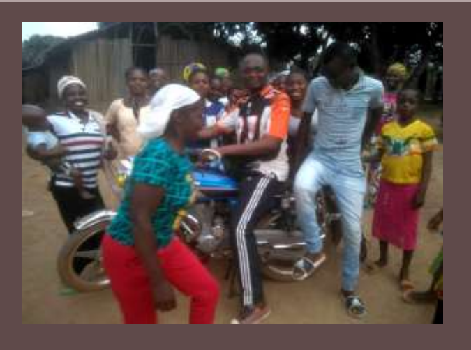
Cameroon: Purchase of five motorbikes for the confreres and seminarians for pastoral missions.