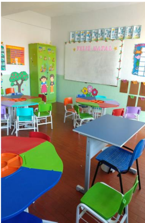
The pre-school classroom

The students at Colegio Maria Montfort school have always enjoyed learning, but have not enjoyed the seats. For years the students were sitting at the same uncomfortable desks at Colegio Maria Montfort school in the city of Fortaleza, state capital of Ceará, Brazil. The VSO recently found comments by an online reviewer, complaining that the desks and chairs were in a terrible state of disrepair and had become a big distraction to learning. An update was long overdue! The school serves about 300 children and adolescents from kindergarten through middle school, from lower income neighborhoods of Fortaleza, Brazil and a variety of ethnic groups. The Province of Fortaleza applied for and was awarded a grant from the VSO to replace these obsolete desks. The clean lines and bright colors of the new desks create a cheerful learning environment. The makeover shows the children