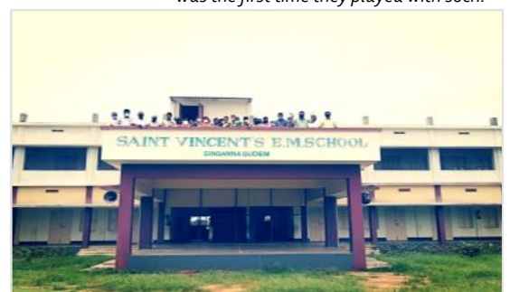
Administrators, teachers and non-teaching staff of the school with the completed building, 2020.

Vincentian Solidarity Office | 500 East Chelton Avenue | Philadelphia, Pennsylvania 19144 | USA Telephone: +1 215-713-3998