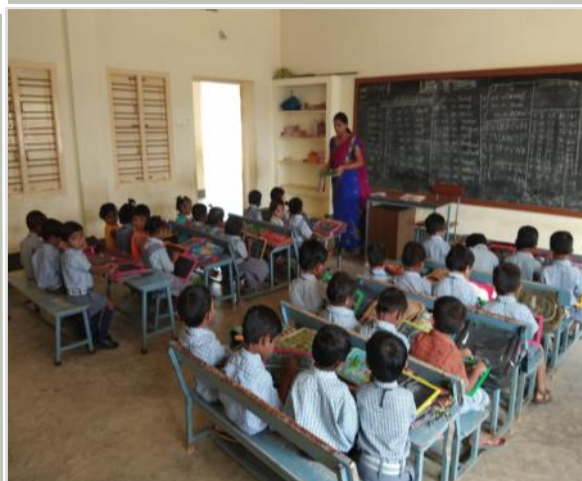
Lower Kindergarten class and teacher, 2019

portion of the building as it was completed, each phase allowing more children to attend. So while the school has been functioning for about two years, the final phase of construction was completed just this summer amid the pandemic shut downs. Because of the government lockdowns due to the COVID 19 virus, the construction workers had to stay at the work site. They were sheltered and fed there by the Province. This allowed the construction to continue throughout the lockdown. Eventually this school will educate six hundred children from age 3 to 15 years old.