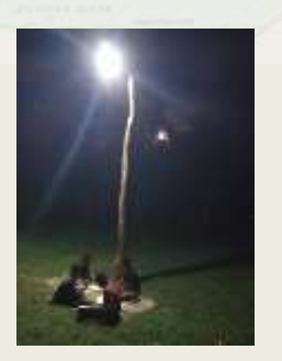
13. International Mission of Papua New Guinea:

Communitymanaged solarpowered streetlights for indigenous rural villages