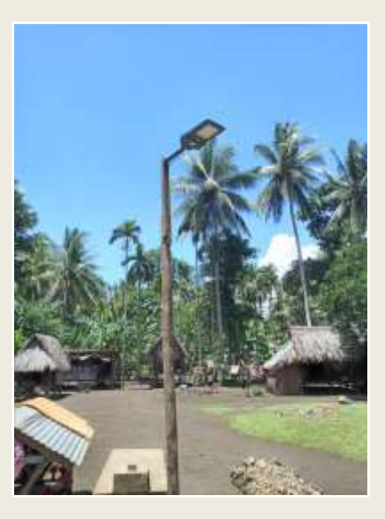
New solar streetlights in Papua New Guinea