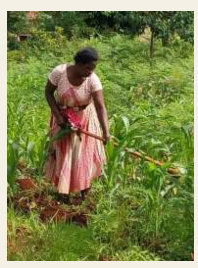
Region of Tanzania: Sustainable support to people living with HIV or AIDS