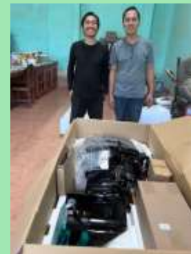
Purchase of Outboard Motor and Equipment for Mission Transportation in Bolivia

Not pictured: Land Rover and motorcycles for Bikoro Parish and Outstations in Democratic Republic of Congo