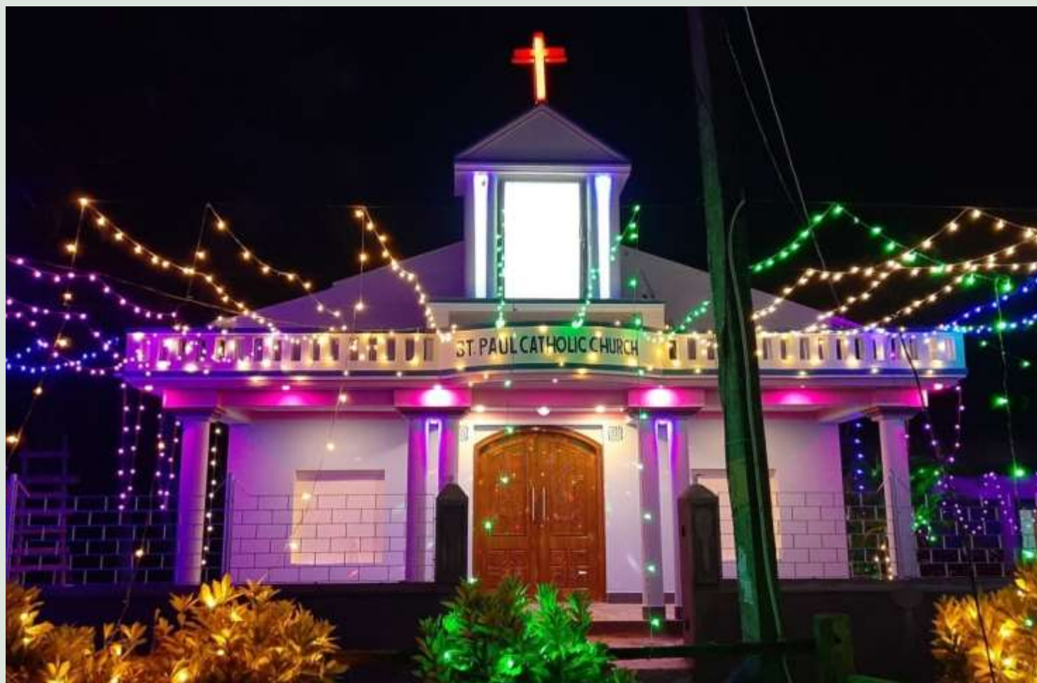
Pictured: Extension and Renovation of St. Paul's Catholic Church at Canning in the Diocese of Baruipur, W. Bengal, India