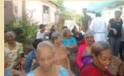
Renovation of Pastoral Home to Serve Elderly Community Members in Cuba

Not Pictured: Communal Garden Demonstrating Integrated Farming System in Papua New Guinea