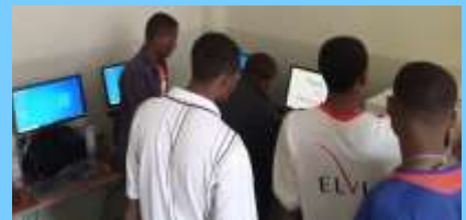
Computer Lab for St. Paul Major Seminary in Ethiopia