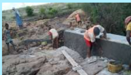
Construction of Wells and Dam for Clean Water and Agricultural Resilience in Madagascar

Not pictured: Drilling Borehole and Installing Solar Water Pump in Malawi