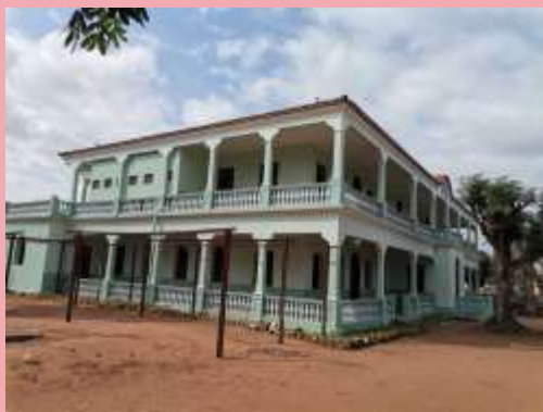
Renovation of the Institute of Agriculture High School in Magude, Mozambique