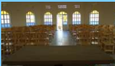
Seminary Phase 3: Construction of Chapel in Rwanda