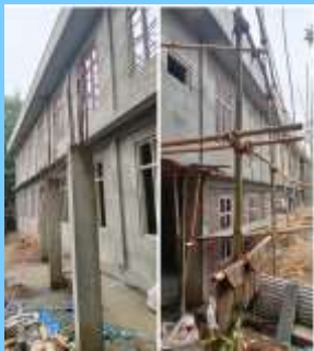
Construction of an Additional Block for St. Vincent's Minor Seminary at Dimapu in India