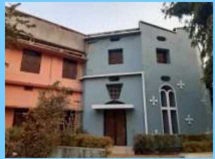
Renovation of Jyoti Nivas Minor Seminary at Baripadain the Mayurbhanj Seminary in India