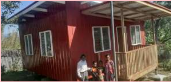
Melanesian Solidarity Village: Phase 1, a housing project in Papua New Guinea