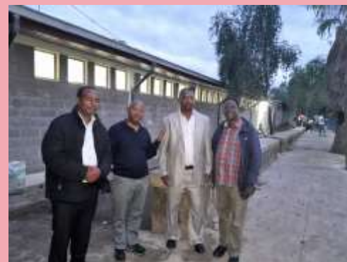
Ambo Deaf School Renovation and Expansion Phase 1 in Ethiopia