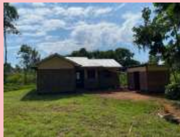
Construction of 5 Houses for Vulnerable Families in Kenya