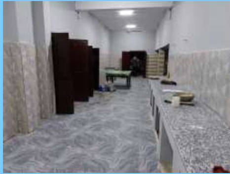
Kitchen Renovation for the Seminary in Enugu, Nigeria