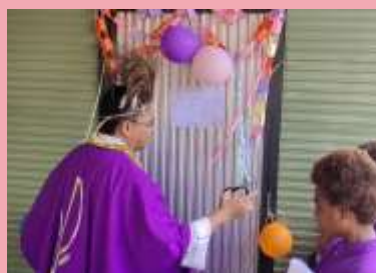
Kindergarten Classroom Construction in Papua New Guinea