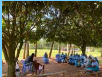
Safeguarding Training for Staff and Congregation Leaders in Vincentian Fathers Projects in Kenya