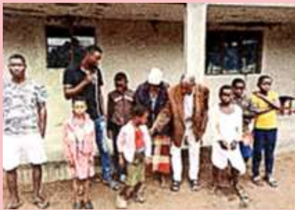
Housing Construction for Homeless Families in Mozambique