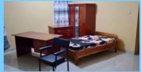
Furniture for the New Malawi Mission