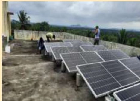
Solar Panels for Provincial House and Offices in India