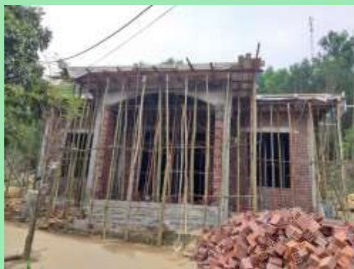
Retirement Home Construction for Elderly Confreres in Viet Nam