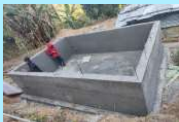
Clean Water, Tree Planting, and Climate Change Education for Molkon and Natjang, India