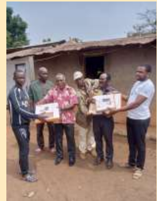
Solar Energy for Seminary and Impoverished Families in Cameroon