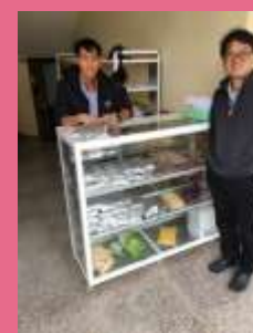
Viet Nam Coffee Roasting and Sales to Support Seminarians and Missions