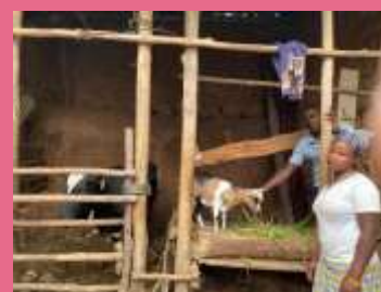
Goat Farming Initiative to Reduce Systemic Poverty in Rwanda