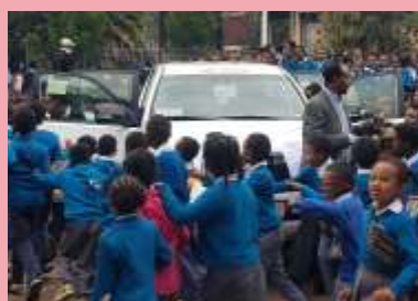
Vehicle for Lazarist Catholic School in Addis Ababa, Ethiopia