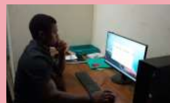
Computers for Seminary, School, and Local Children in Cameroon

Not Pictured: Vehicle for Dawn of Hope School in Ethiopia