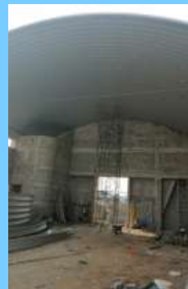
Partial Funding to Enlarge and Remodel the Church of St. Vincent De Paul Parish in Guatemala

Pictured on front cover: Extension and Renovation of St. Paul's Catholic Church at Canning in the Diocese of Baraipur, West Bengal, India