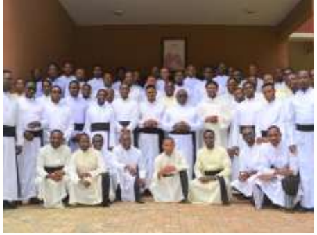
Repairs to refectory for Common Theologate