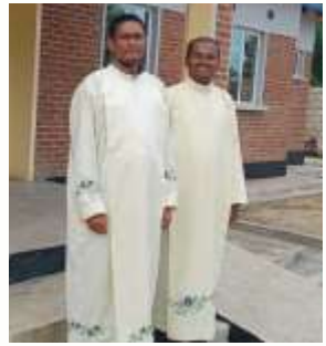
Furnishings for St. Joseph presbytery in Malawi

Not pictured: Chapel construction for seminary complex, Rwanda; Additional rooms construction at St. Vincent's Minor Seminary, Dimapur, India; Vehicle purchase for Angola; Vehicle purchase for Malawi; 3 jeeps purchase for India; Vehicle purchase for Rio de Janeiro Mission, Brazil; School bus for COVIAM Seminary, Enugu, Nigeria; Internal seminary construction for Bikoro, DRC; Construction of presbytery at Mudapallur, India