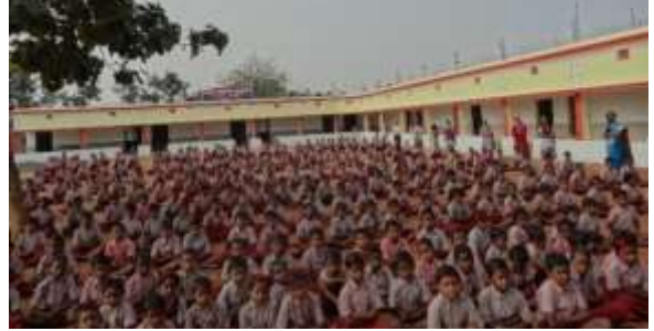
Modernization of St. Xavier's School at Saprunguttu, in Jharkhand with a computer lab, India