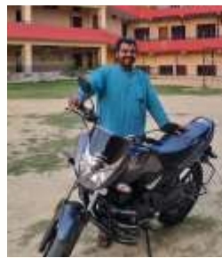
Purchase of a motorbike for the new mission in Nepal