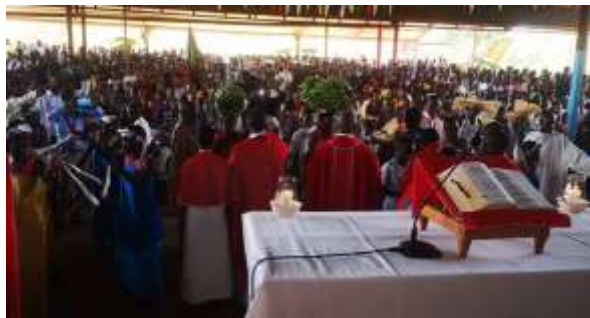
Catechistic, educational and athletic training for young people in the Burundian Refugee Camp, Rwanda

Not Pictured: Prisoner education program start-up, Albania