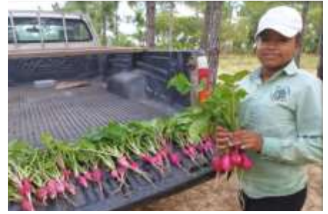
Environmental education and volunteer program for indigenous communities, Honduras