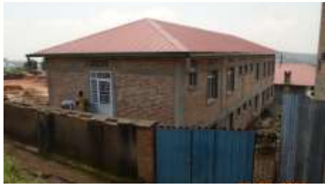
Construction of internal seminary and meeting rooms, Rwanda