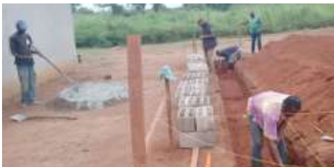
New school building for École Saint Vincent de Paul de Belita II, Batouri, Cameroon