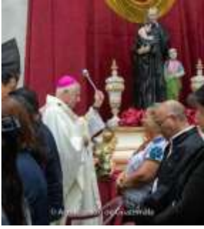
Partial funding to enlarge and remodel the Church of St. Vincent de Paul Parish in Guatemala