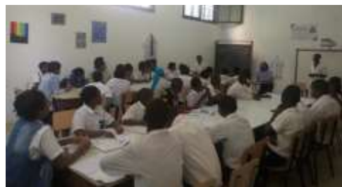
Support for childhood education through systematic change program, Mozambique