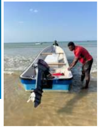
Supporting subsistence fisherfolk communities of the Indian Ocean, Tanzania