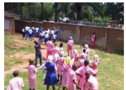
Fence for St. Joseph's Inclusive School, Nigeria

Not pictured: Generator for School and Church complex at the International Mission of Chad