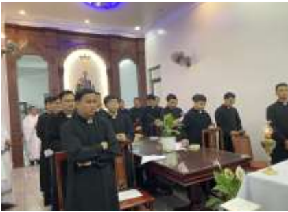
Construction of community house for confreres and student, Viet Nam