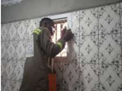
Renovation of pastoral house in Douala, Cameroon