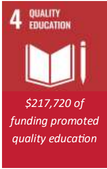
Seed germinator for agricultural school, Honduras