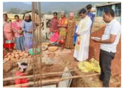
Renovation of Dukuma Church, India