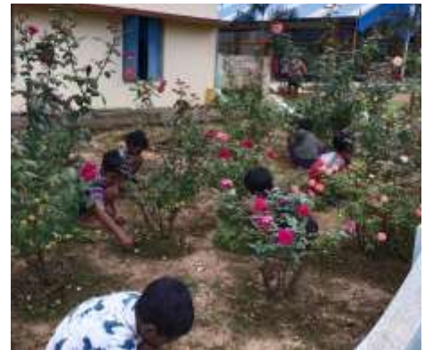
Construction of a kitchen for the boy's hostel at the Mission Station at Christnagar in Gajapati District of the State of Odisha, India