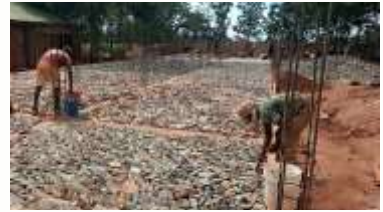
Construction of major seminary building in Morogoro, Tanzania