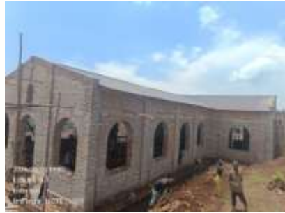
Reconstruction of the collapsed church in Kidasha, Burundi