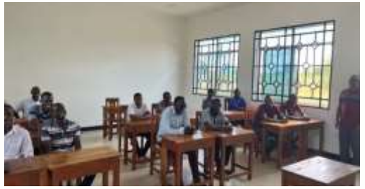
Furniture for minor seminary, Tanzania