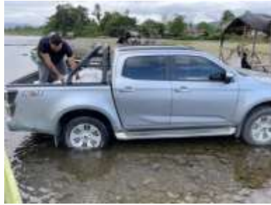
Vehicle for the Indigenous Mission of Talamanca, Costa Rica