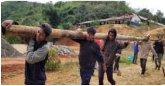
Construction of the parish community hall at De Paul Parish in Manipur, India

$133,019 of funding helped build strong communities