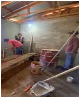
School renovations in Jesús de Tavarangüe, Paraguay