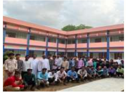
Renovation of Jyoti Nivas Minor Seminary at Baripada in Mayurbhanj, India