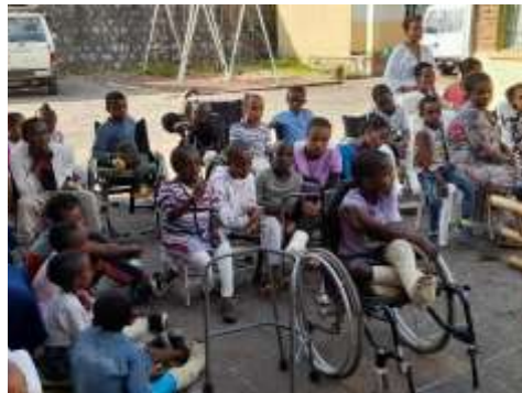
Repairs due to fire at Alemachen Center for Physically Disabled Children, Ethiopia