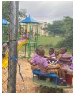
Playground equipment for St. Joseph Inclusive School, Nigeria